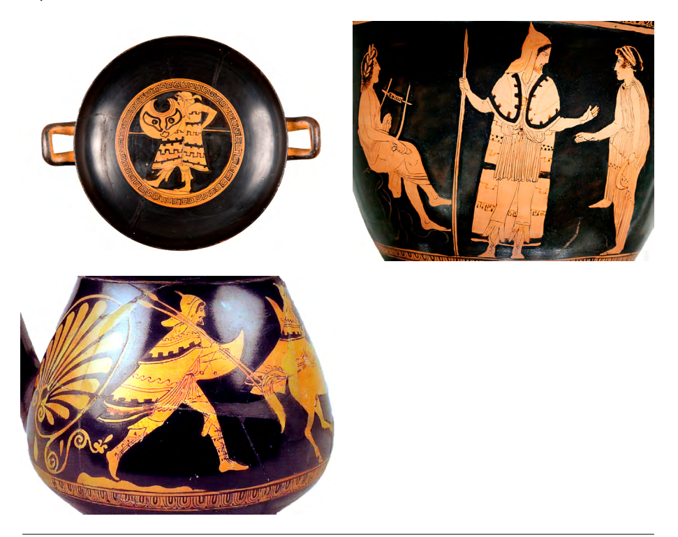
Figs. 2-4. Ancient depictions of Thracian warriors on an Attic red-figured ceramic: a peltast, with a characteristic hat, crescent shaped shield and high boots, ca 550 BC (Harvard University, Arthur M. Sackler Museum, Robinson Collection 1959.219.); Orpheus among the Thracians - krater by the Painter of London E 497, ca 440 BC (Metropolitan Museum, Fletcher Fund, 24.97.30); a Thracian warrior with pelta (shield) and spears 475-435 BC (Archaeological Museum, Sozopol, inv. No. 261).

Given the scarcity of the material, it is extremely difficult to date Thracian as a language. It seems however that one can claim with relative certainty that the language was spoken through the Iron Age and into the Roman Era. There are examples of the Linear B forms from Crete which have been interpreted as Thracian names, cf. e.g. o-du-ru-we (Dat./Loc.sg.) KN C 902.6, (Gen.sg.) o -[ du-ru-wo KN Co 910 apparently to Thrac. name Ὁδρύσαι, which might well point to the existence of Thracian as a separate linguistic unit in the chronology comparable to those of Mycenaean Greek (Hajnal 2003, 134). If we assume that the hypothetical Balkan linguistic unity (irrespective of genetic or more typological sorts) was still present around 2000 BC, we may claim that, after the first wave of migration of the Proto-Greek tribes, the other Balkan groups (Proto-Thracian/Proto-Macedonian/Proto-Phrygian) occupied the historical regions of Macedonia and Thracia, and the migrations