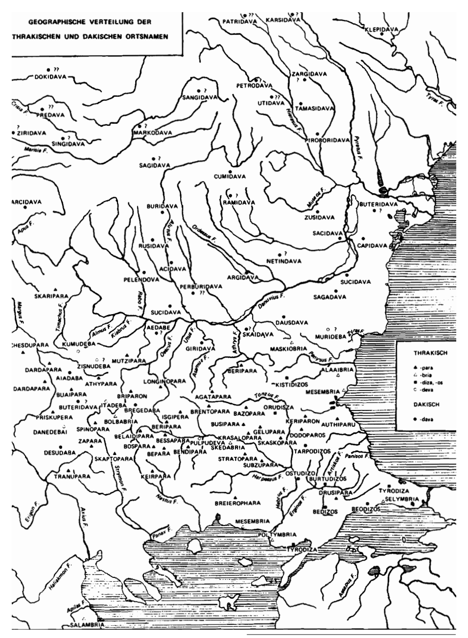
Fig. 12. The distribution of Thracian and Dacian place-names (Duridanov 1985, 151).