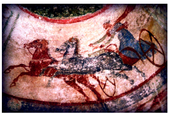
Figs. 5-6. Details from the Thracian burial mound from Kazanlyk (4<sup>th</sup> cent. BC).