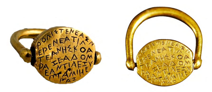
Figs. 9-10. Golden Ring from Ezerovo, first half of the 5<sup>th</sup> cent. BC (National Archaeological Institute with Museum Bulgarian Academy of Sciences in Sofia; inv. No. 5271).

Last but not least, 75 graffiti on pottery have been recovered from the sanctuary of the Great Gods in Samothrace and c . 220 graffiti fragments on pottery written in an unknown language, probably a form of Thracian found in the sanctuary of Apollo in Zone on the coast of the Aegean.<sup>15</sup>